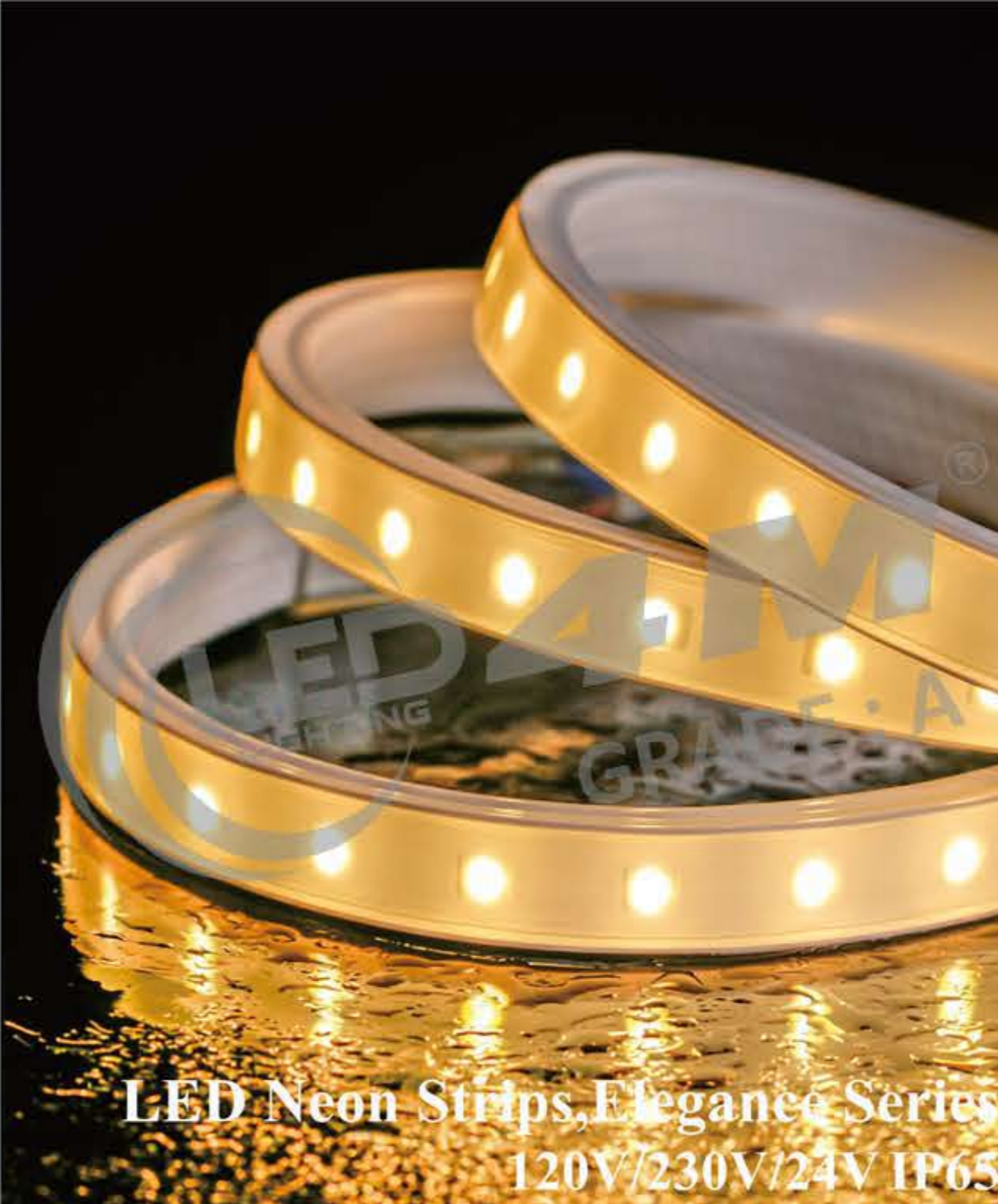
LED Neon Strips, Elegance Series 120V/230V/24V IP65