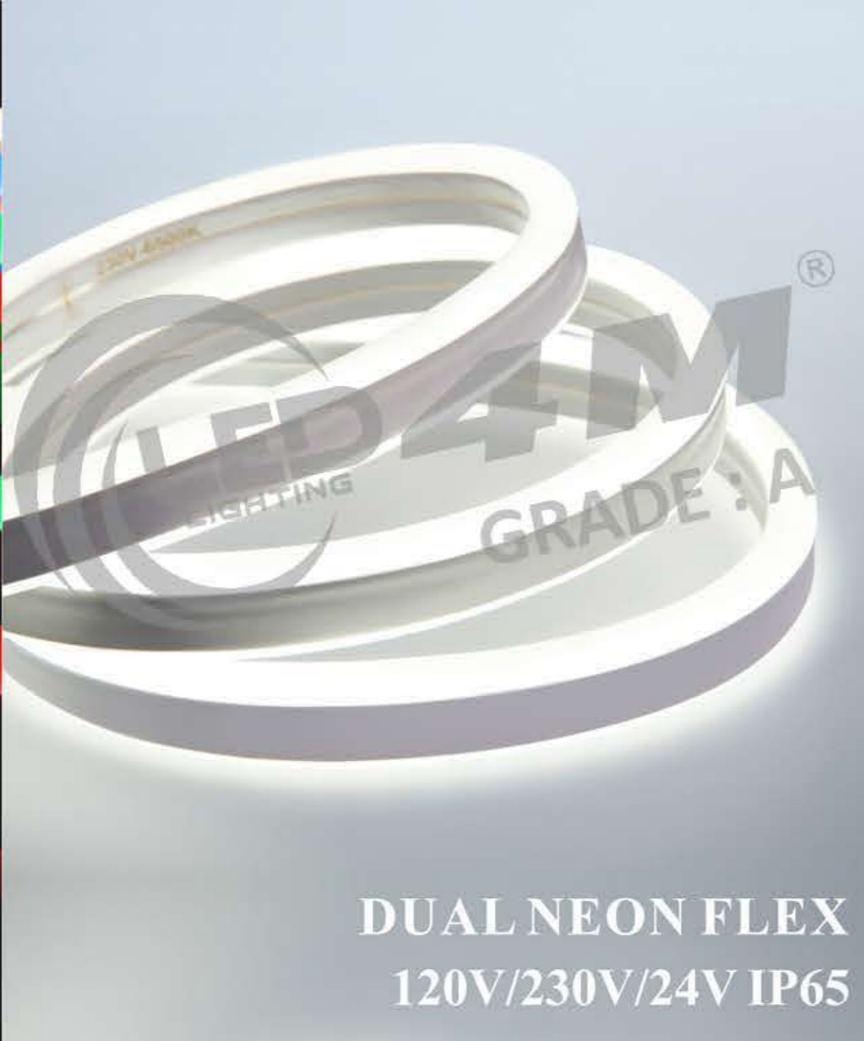
DUAL NEON FLEX 120V/230V/24V IP65