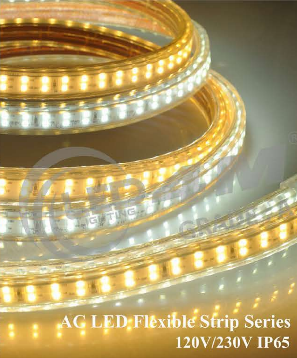
AC LED Flexible Strip Series 120V/230V IP65