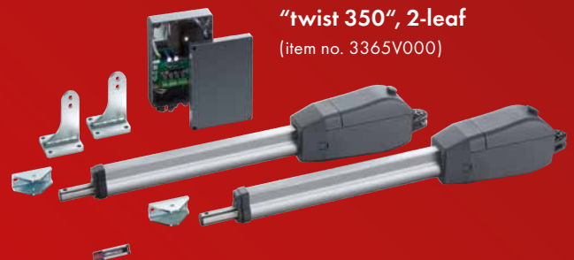
"twist 350", 2-leaf (item no. 3365V000)

incl. 1 swing gate operator, control board in housing, pluggable radio receiver (FM 868.8 MHz), post and gate wing brackets, mounting material and 4-command transmitter (item no. 4020)