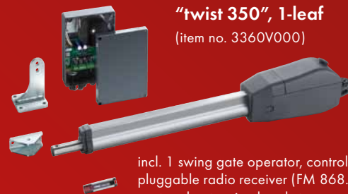
"twist 350", 1-leaf (item no. 3360V000)

incl. 1 swing gate operator, control board in housing, pluggable radio receiver (FM 868.8 MHz), post and gate wing brackets, mounting material and 4-command transmitter (item no. 4020)