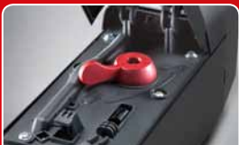
Secure and convenient emergency release system; no tools required