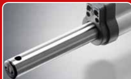
Electronic limit switches with Reed contacts provide for a precise travel limitation

Last updated: 01/2013. Literal errors, errors and technical changes excepted.