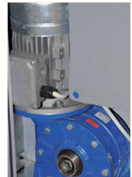
Sturdy and performing motor