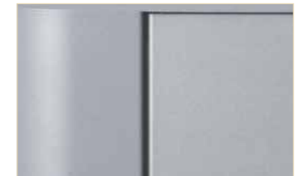
Anti-UV powder painting