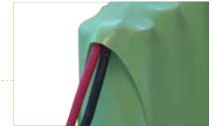
Internal battery back-up as optional