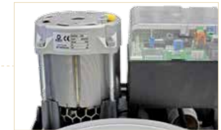
Sturdy and performing motors