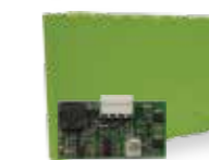
KBPKN Kit 24 Vdc batteries, 1,3 Ah and battery charger BCN