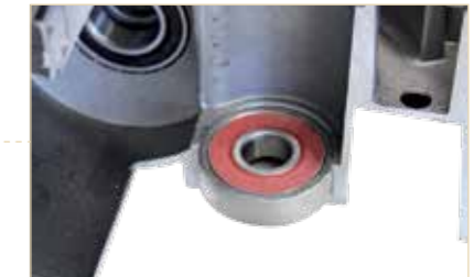
High quality ball bearing