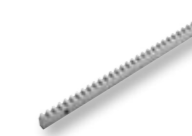
CREM-8 M4 iron toothed rack 30x8 mm L=1000 mm