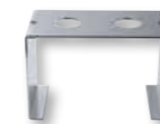
CPHSC-50 Rised fixing plate