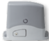
SC7224 700 kg